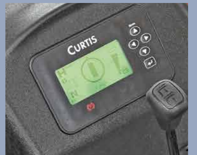
Instrument can display the steering angle and direction Synchronously