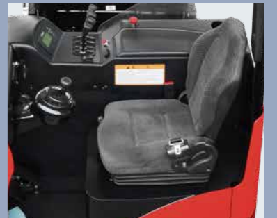
Comfortable and convenient seat