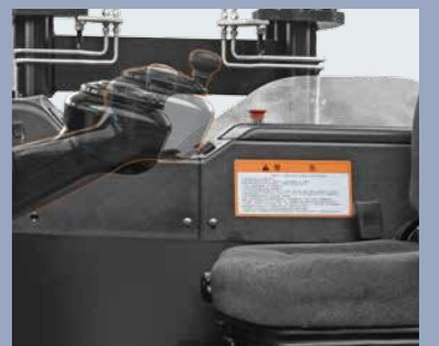
The steering wheel is extensible, so the operator can choose the best driving position